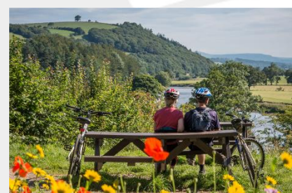
Crook O' Lune