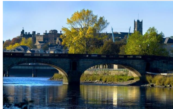
The Historic City

Despite being a university city and home to 138,000 people, over two thirds of Lancaster is classed as rural area. Surrounded by many pretty villages, it is a very pleasant place to live. Lancaster benefits from excellent rail and road links, indeed the school is easily accessed from the M6 motorway. The city offers the usual attractions of a vibrant place to live, but also has some beautiful areas of outstanding natural beauty on the doorstep. The coast is easily accessed; Blackpool, the beautiful Fylde Coast and Morecambe Bay are within 40 minutes' drive. The Lake District is 30 minutes away. Liverpool and Manchester are less than 1 hour away. London is less than 3 hours away by train, with Lancaster being a mainline west coast station, giving easy access to Scotland.